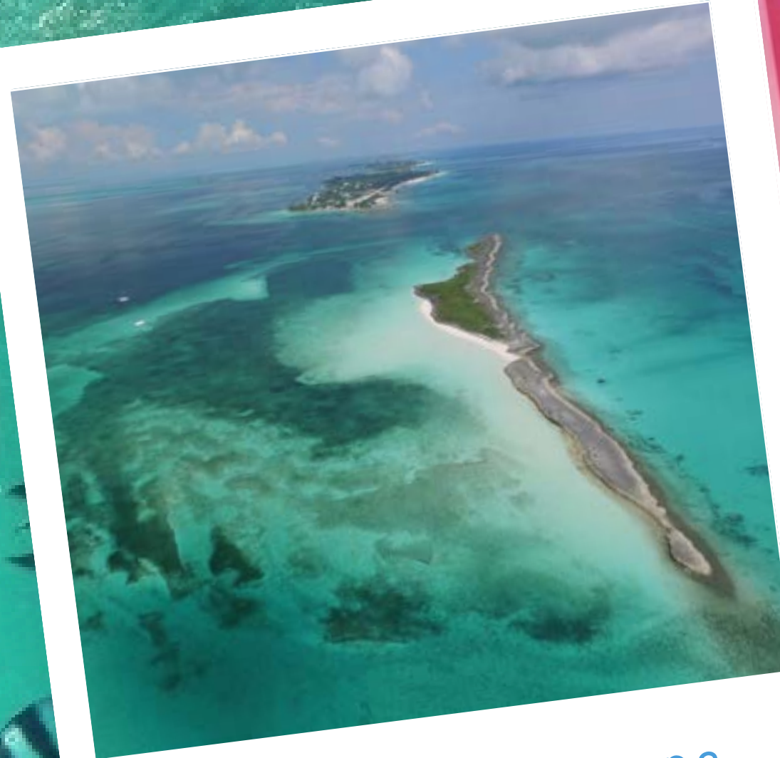
FOWL CAY, ABACOS