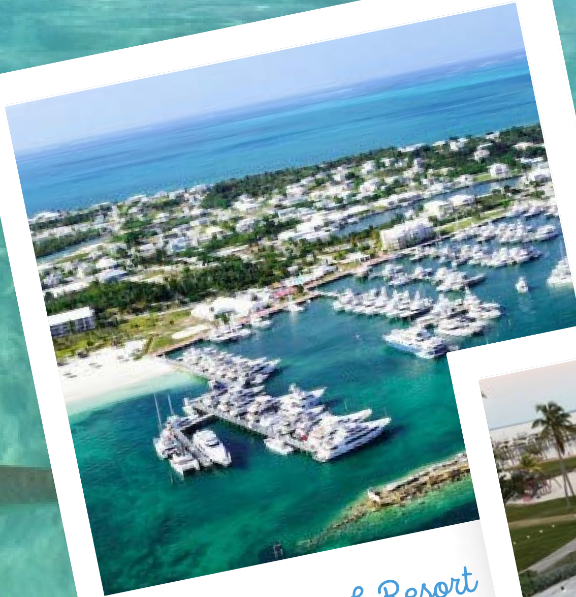
Abacos Beach Resort