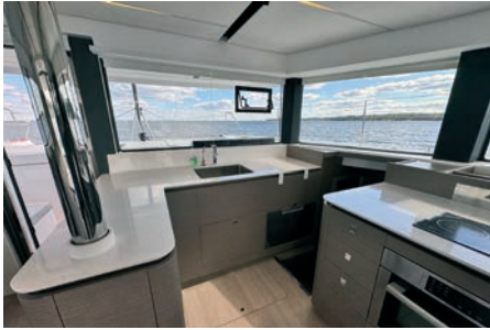
The galley is located on the starboard side of the main deck and is very well equipped as standard.