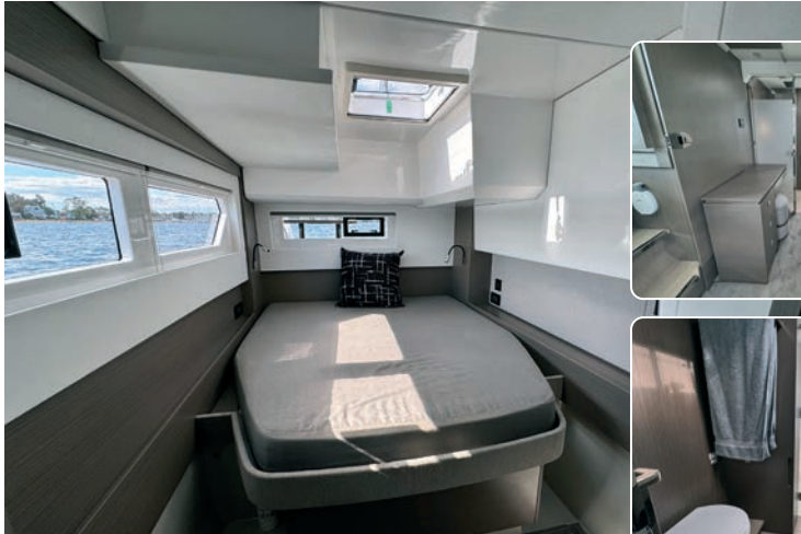
The owner's cabin occupies the starboard hull and includes a desk and pretty large bathroom.