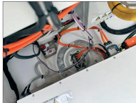
The electric propulsion system is housed in the same location as the diesel engines and includes two 25-kW pods.

turer. To carry out this mission, Leopard took care to capitalize on its success by improving what could be improved. The result is convincing: the Leopard 46 features a reworked, highly livable interior, without sacrificing performance or comfort. The real surprise of this 46 is the possibility of choosing an electric motor; a new feature that allows the manufacturer to stay in the race. In short, the Leopard 46 is a smooth evolution... which, in our opinion, is sure to be as successful as its predecessor.