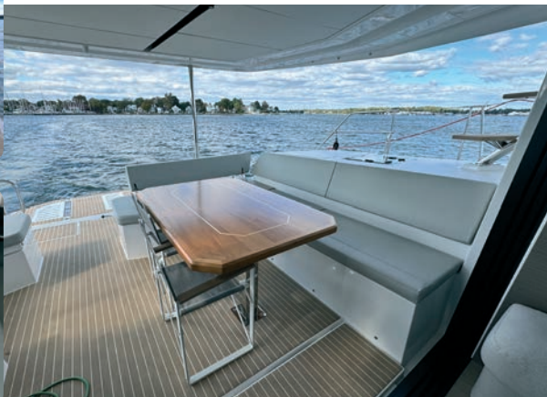
The cockpit is almost identical to that of the 45, with a dining area on the port side, a seat under the helm station and a grill.