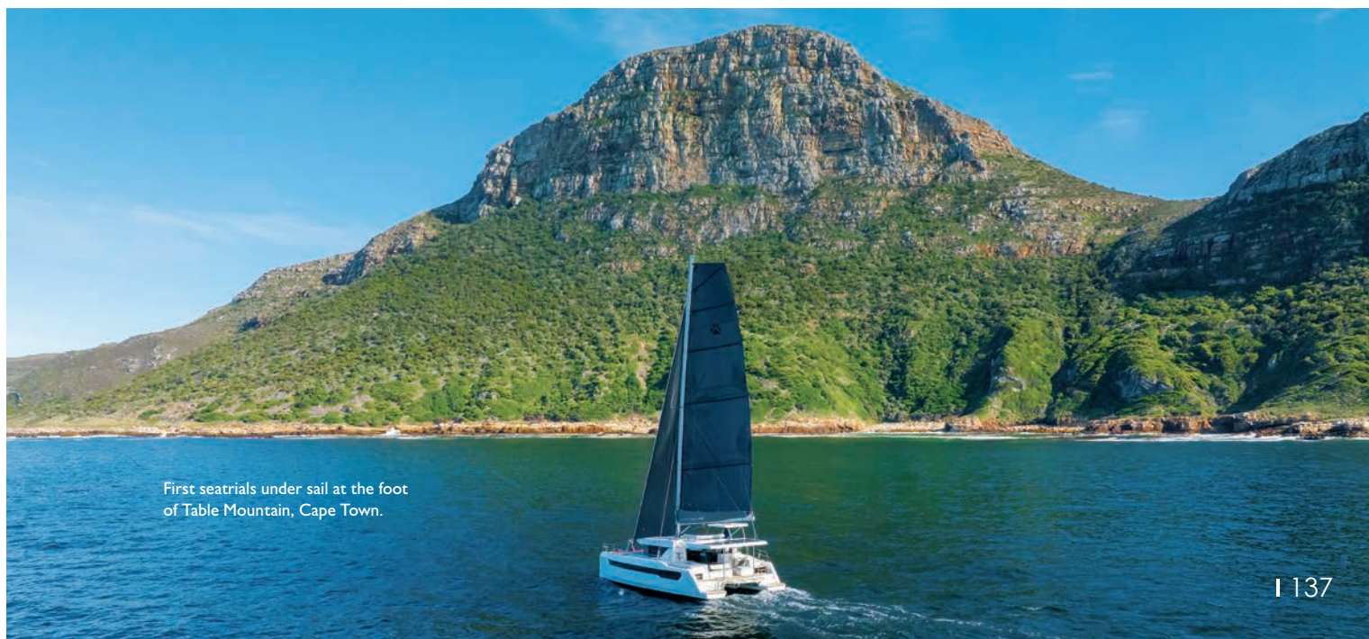
First seatrials under sail at the foot of Table Mountain, Cape Town.

The catamaran's circulation has been well thought out, whether in terms of the side-decks, which are wide enough to pass each other, the cockpit or even the interior, with a door leading directly from the main deck to the forward cockpit. In fact, you can almost go from the stern to the bow without encountering any obstacles. A key consideration for Alexander Simonis, the architect, the idea being to abolish as far as possible the frontier between exterior and interior. Once the sliding doors separating the cockpit from the main deck are fully opened, the challenge is a complete success. In addition, the galley is no longer aft of the main