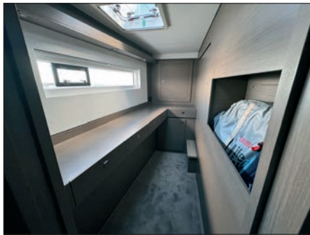
Guest cabins are spacious, and all have a private head.