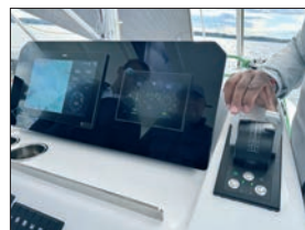
The entire electrical system can be controlled from this touch screen, thanks to a clear, intuitive interface.