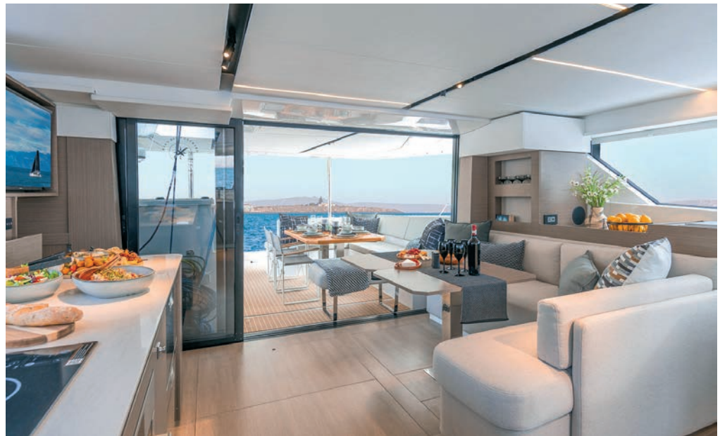
The opening cockpit/saloon is much bigger than the one on the Leopard 45.

kWh lithium batteries. This electrical energy comes from a number of sources, starting with solar panels, a generator and a clever propeller-driven hydrogeneration system that recharges the batteries when under sail at speeds of 4 knots or more. The whole system is controlled by the HMI, a simple and intuitive interface that indicates the status of the electrical system in real time, i.e. the production of solar energy or that coming from hydrogeneration. It also allows you to intervene on the system to fine-tune settings, and in particular to choose the desired percentage of hydrogeneration. If the battery is too weak, the system automatically switches on the generator to replenish the charge, and in the event of overload, the system automatically goes into safety mode. This is an effective solution that ensures almost total energy self-sufficiency when cruising. In terms of safety, the battery bank is equipped with an extinguishing system to prevent on-board fires, and is also designed to withstand humidity,