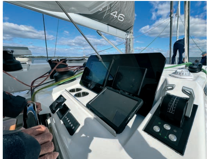
The helm station is very complete, with an unobstructed view of the sea and the rig.