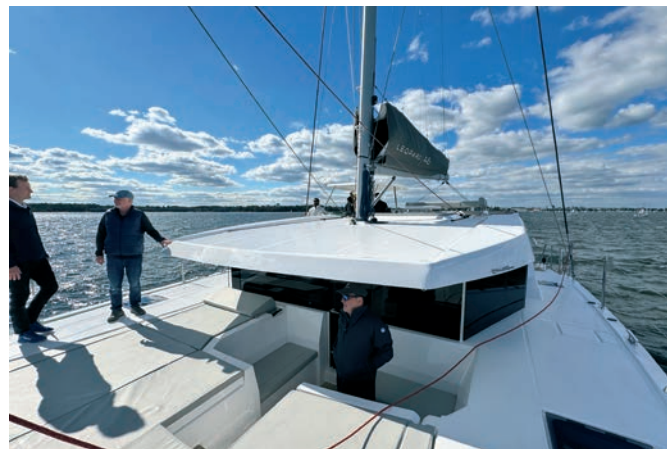
The Leopard 46 is easy to move around thanks to wide side-decks and an uncluttered foredeck.

By completely redesigning the interior layout, Leopard was able to optimize space. As a result, the Leopard 46 is available in three, four and even five cabin versions, including the crew cabin - not bad for a 46-foot catamaran. The three-cabin version offers considerable volume, as the owner's cabin occupies a good part of the starboard hull, and is complemented by the