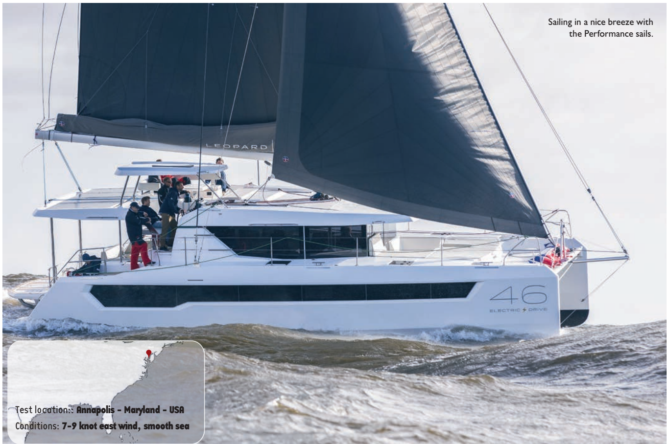
Sailing in a nice breeze with the Performance sails.

Test location: Annapolis - Maryland - USA Conditions: 7-9 knot east wind, smooth sea