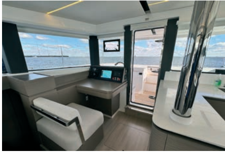
Forward, to port, there's a full-fledged navigation station with an unobstructed view of the route ahead.

making this catamaran easy to operate single-handed. The second pleasant surprise, once the sails are hoisted, is the catamaran's responsiveness, taking advantage of the slightest breeze to accelerate. The 46 needs a little time to establish a stable speed, but once underway, its performance is quite satisfactory. As a catamaran with skeg keels, its optimum performance lies around 90° to the true wind, and this is precisely where we achieved the best results. Under code 0, with 11.5 knots of wind, the Leopard 46 made 7.8 knots. Then, as we tacked, we hit a little more wind, enabling the multihull to reach 8.5 knots with 14 knots of wind, which is pretty decent. In slightly more sustained conditions, the catamaran should easily maintain a speed of 9 knots, which is quite satisfactory for the boat's program. Unfortunately, we didn't have a spinnaker on board this model. A pity, as the catamaran should perform quite well with this sail. In addition to performance, we really appreciated the smoothness at the helm, as well as the multihull's responsiveness. Tacks and gybes are carried out smoothly, making sailing all the more enjoyable. When it comes to on-board comfort, the helm station is also