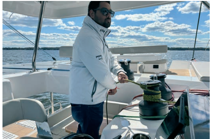
The Leopard 46 was designed to be sailed single-handed, with all halyards led back to the helm station.

brings the standard sail area to 144.4 m 2 (1,554 sq ft), with the option of adding a spinnaker and/or gennaker. There's even the option of a set of Ullman sails optimized for performance. For our test, we had the standard sail with a Code 0, which is nowadays an essential sail for boosting a pure cruiser. To put the 46 through its paces, we had an easterly wind of 7 to 9 knots, with smooth sea. Rather mild conditions, in line with what we often find in Chesapeake Bay, but already giving us an idea of the new Leopard's capabilities. The first thing to notice is just how easy it is to use. Everything has been designed to be controlled from the helm,