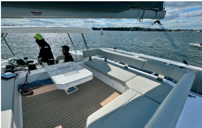
The sun lounge has been moved forward to allow the installation of solar panels on the aft part of the bimini.